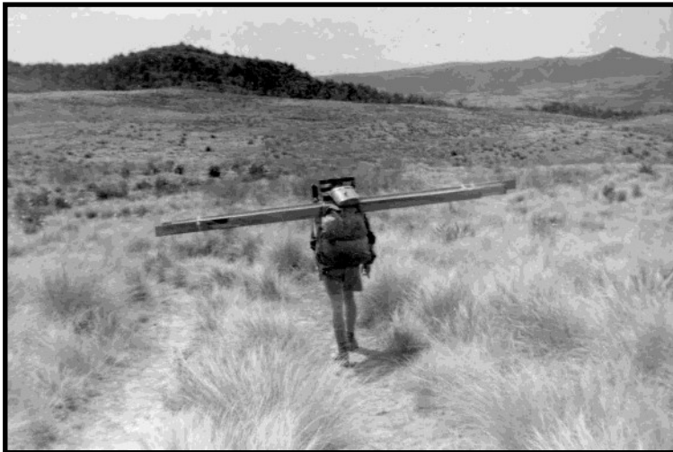
Carrying replacement floorboards in to Green Hut, 1960's (photo taken in the Hightop area)