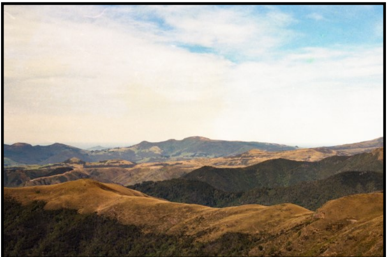
Yellow Ridge from The Gap as seen in 1986 - a lovely tussock covered ridge