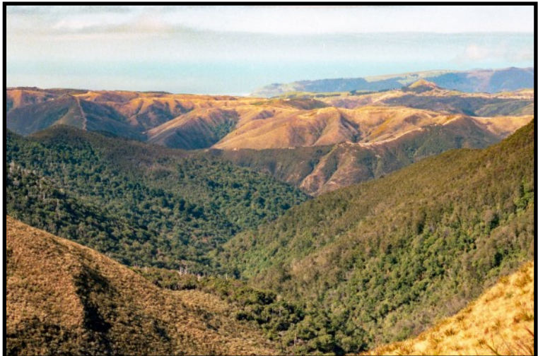
1987 view from above Green Hut across the Double Hill , Mountain Road and Blueskin Bay