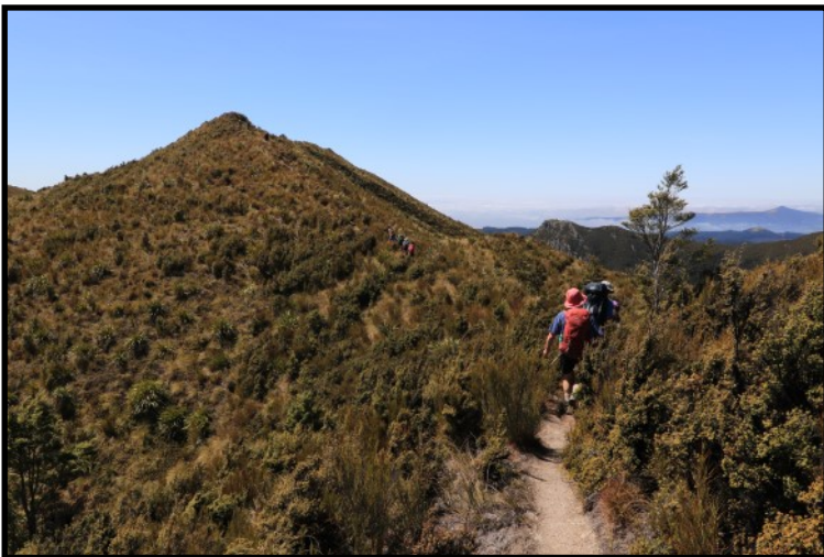
Good track on southern end of Rocky Ridge