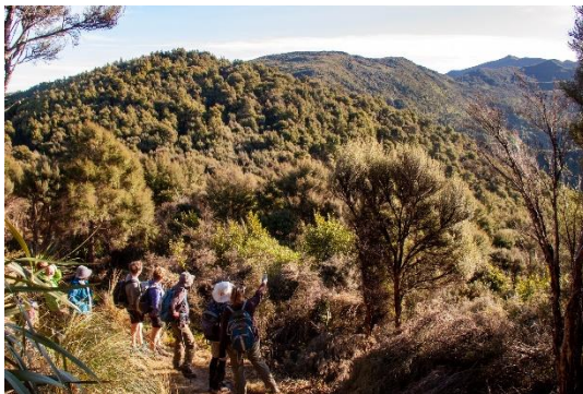
Looking towards Green Hill and Pulpit Rock.

What a brilliant day to be celebrating the 90th anniversary of the opening of Green Hut in the Silver Peaks! Green Hut was built by the Otago Tramping Club within a three month span in 1933 to mark the 10th Anniversary of the club, and was officially opened on 3 June 1933. The hut was visited frequently by the club right up until it's demise in 1988, when it was dismantled after nearly 65 years.