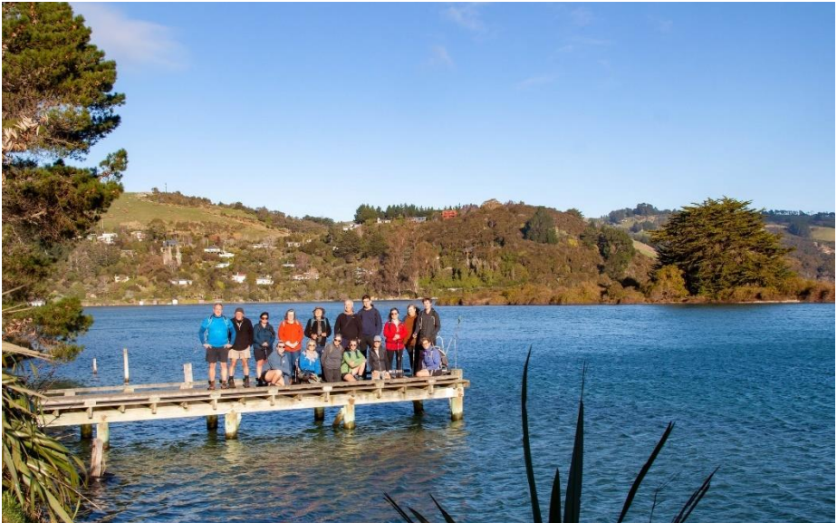
Group Photo.