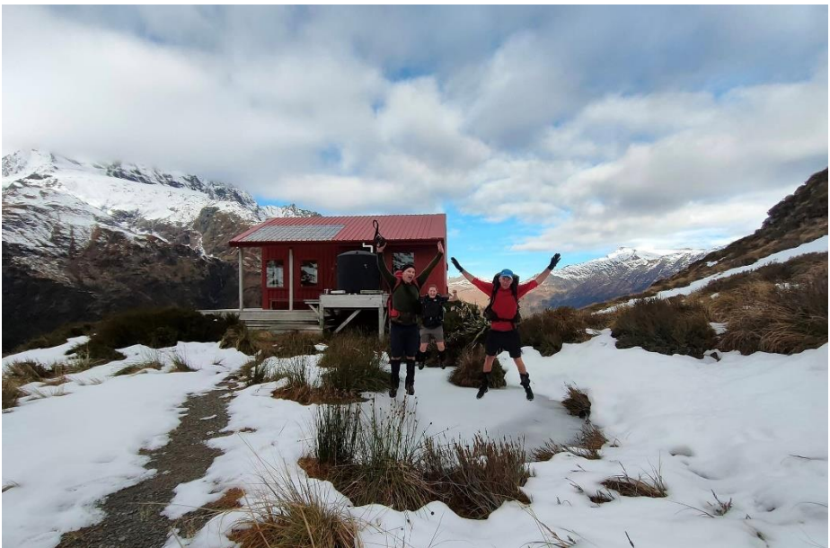
Testing the Ice Pond.

We made it up. Clearing the bush line, the views were immense and glorious. Mountains surrounding us, thick with fluffy white snow, other just dusted. French Ridge Hut across the valley, wee red dot sitting on a snowy ridge. Of course, photos a plenty, back down the valley where the West Matukituki river wound itself along the valley floor.