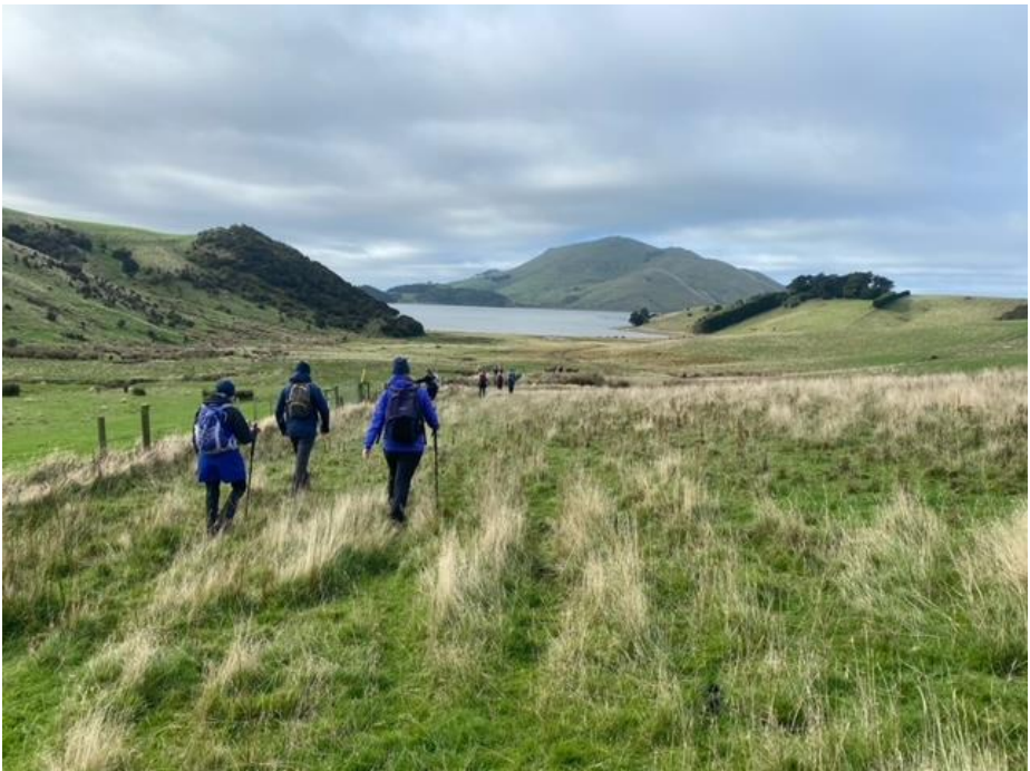
Bit of farmland walking.

With adding extra layers, coats, hats and gloves on, and parking our cars on the side of the road at Hoopers Inlet, 17 of us made our way up the very steep climb of the Nyhon track to the top of Highcliff Road where of course we were met with stunning views on a brisk cool day. We then continued to the Lime Kiln just off the side of the road for morning tea, then continuing along the road to complete the circuit, stopping for lunch at the old ruins just off the track before making our way down steeply through native bush, swamp and farm land of the Hoopers Inlet track and then connecting with the Nyhon Track again and back to our cars. A very enjoyable day.