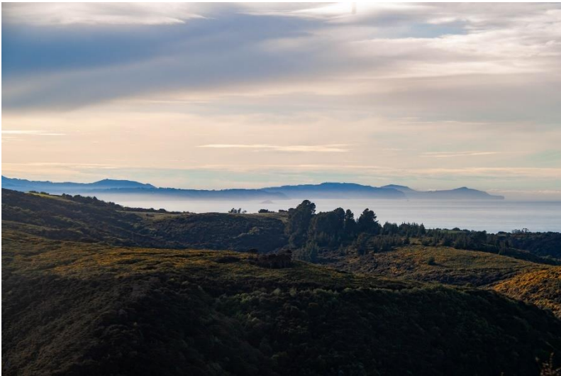
The hills of the Otago Peninsula in the distance - Sandymount on the far right with Mt Charles slightly further to the left.

After all the effort of climbing to 200m from sea level, the track then drops steeply via zig zags over the next kilometre back to sea level. John Bull Gully is a peaceful grassy cove in a bay on the edge of the Taieri River with a couple of picnic benches and is the perfect place for lunch while watching the river lazily flows past. With