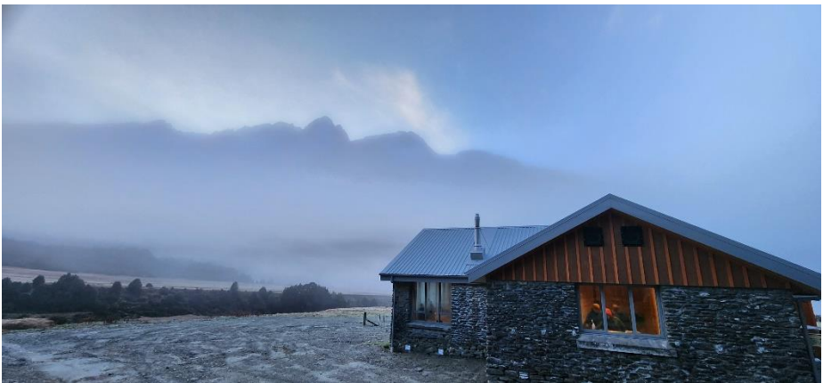
Aspiring hut.

The 2ish hour hike in for the first two carloads was beautiful, we gazed up at the Rob Roy Glacier through a break in the hills. And it would be the only chance to view it. The bridge had also been closed for safety reasons so no up-close encounters this time either!