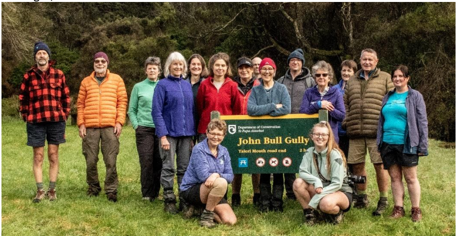
Team Photo!