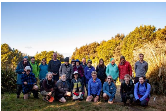
Team photo.