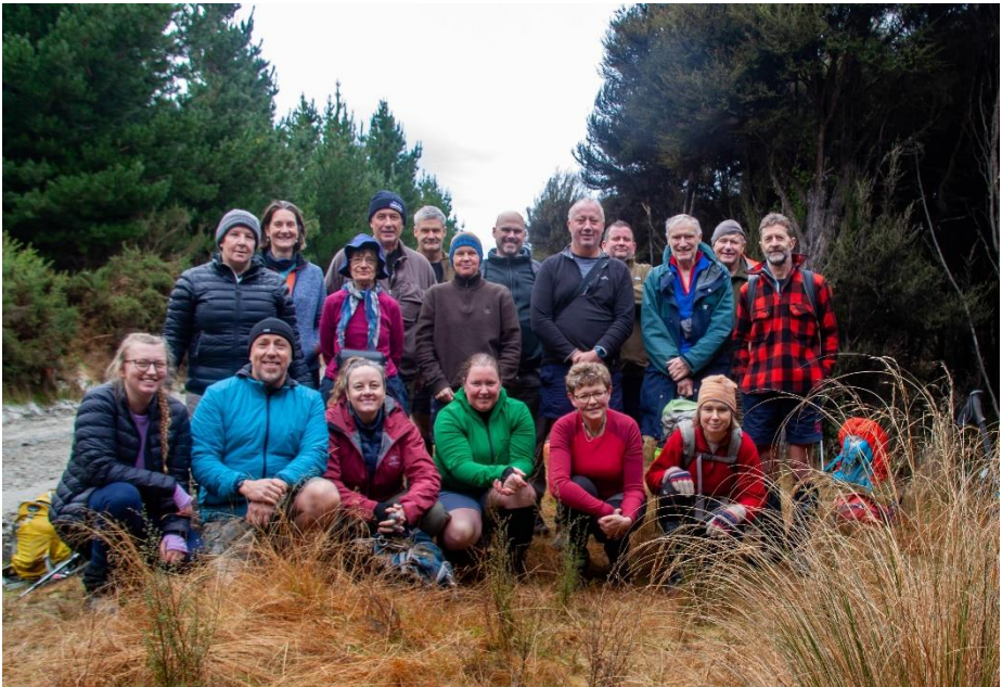
Team!

headed home after a very satisfying 18km walk it was a great way to spend a winters Sunday..